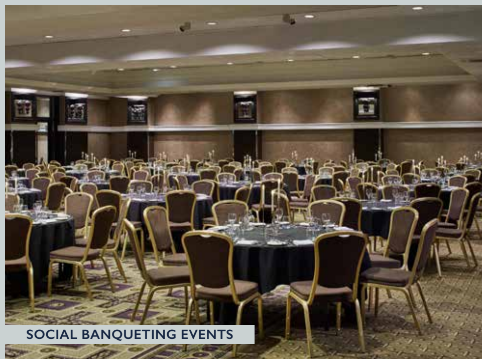
SOCIAL BANQUETING EVENTS

We can comfortably accommodate up to 700 delegates in a theatre set up and our central and accessible Manchester location and access makes us one of the most convenient conference venues in the city.