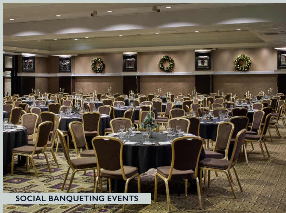
SOCIAL BANQUETING EVENTS

We can comfortably accommodate up to 700 delegates in a theatre set up and our central and accessible Manchester location and access makes us one of the most convenient conference venues in the city.